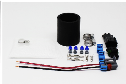
400-1174: Installation Kit