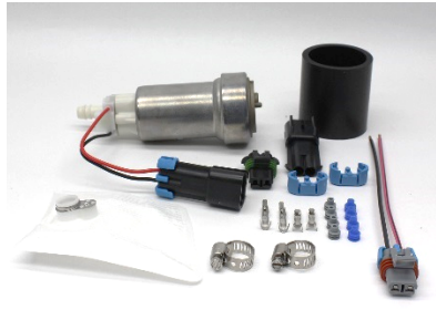
TCD301: Pump and Install Kit